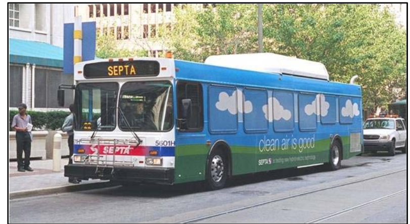
SEPTA: Hybrid Buses